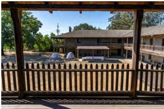
Petaluma Adobe