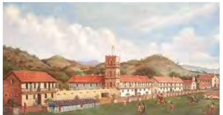
General Vallejo Reviewing His Troops in Sonoma, 1846 Painted in 1879 by Oriana Day Located in the Vallejo Home (Property of California State Parks)