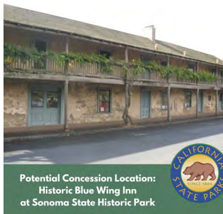
Potential Concession Location: Historic Blue Wing Inn at Sonoma State Historic Park

The Bay Area District Office of State Parks also held a Public meeting in October, looking for input regarding what we, in Sonoma, want to see the Blue Wing Inn evolve into, as the development progresses. If you have an idea, or want to be the financial angel,