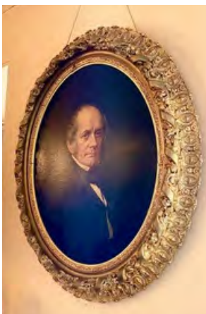
Thomas O. Larkin