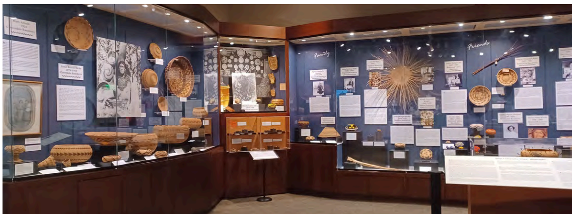
Santa Rosa JC Museum