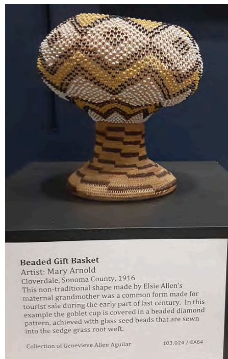
SRJC Museum