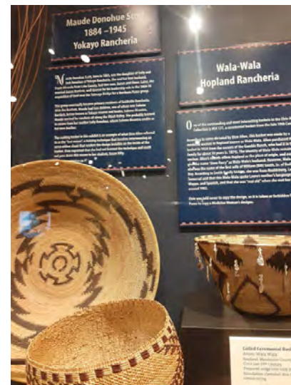
SRJC Museum

[ Editor's Note : Due to the positive community response to this exhibit, the museum has decided to keep the Elsie Allen Pomo Basket Collection up permanently! For more information, visit the SRJC website ]