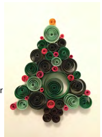
Quilled Christmas ornament